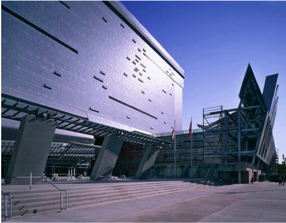
California Department of Transportation (Caltrans) District 7 Headquarters , in Los Angeles, California.