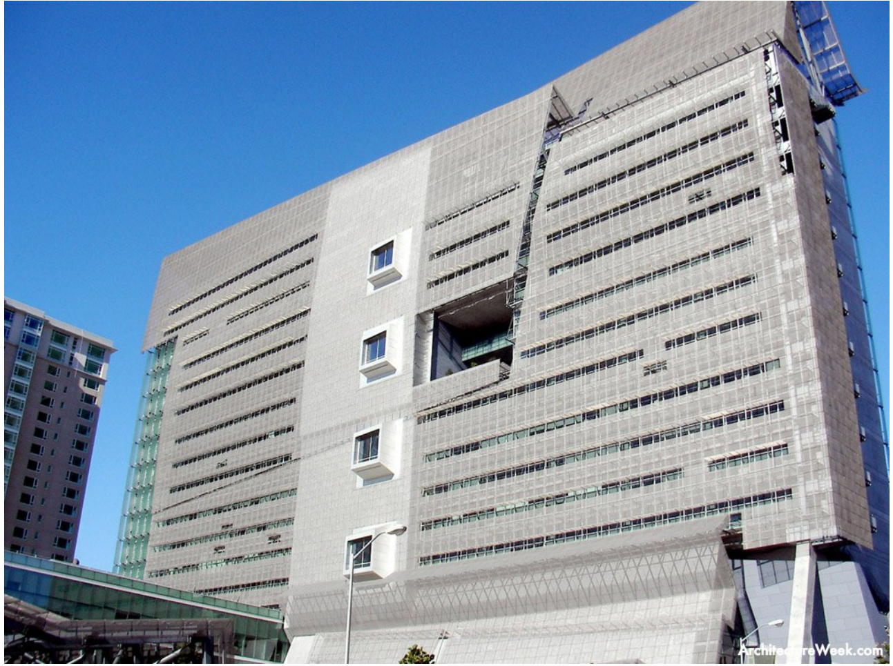
The San Francisco Federal Building, in San Francisco, California.

41 Cooper Square, in New York City. Giant Group Campus, in Shanghai, China