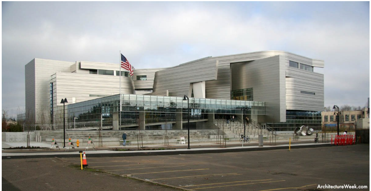
Wayne L. Morse U.S. Courthouse, in Eugene, Oregon.