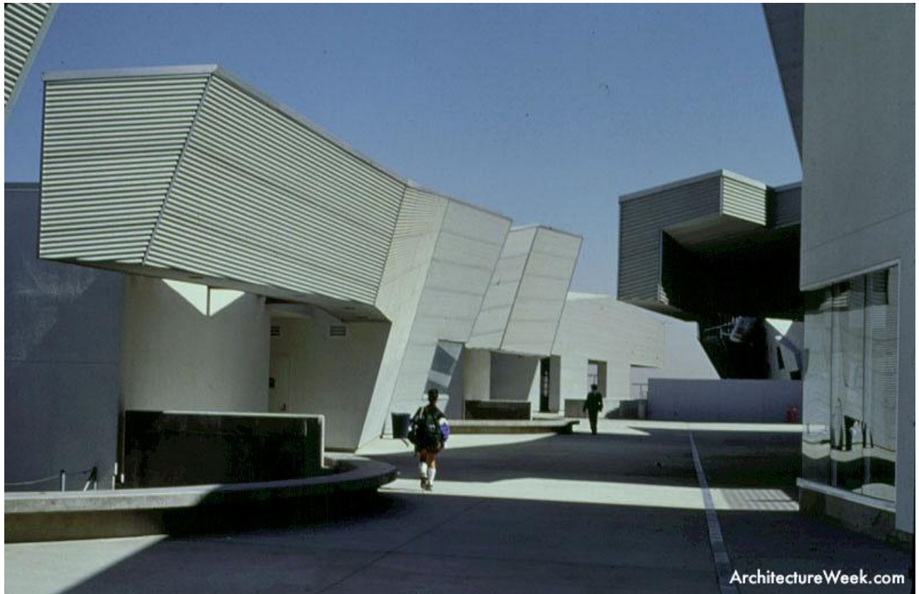
Diamond Ranch High School, in Pomona, California.